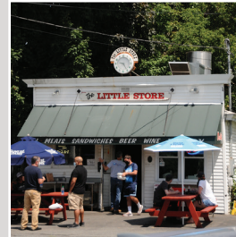
The Little Store Lebanon, NH