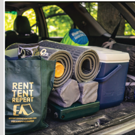
Effortless Adventures Plymouth, NH