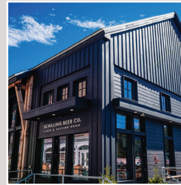
Schilling Beer Co. Littleton, NH

GRDC connects businesses and entrepreneurs from a variety of industries to critical resources and services.